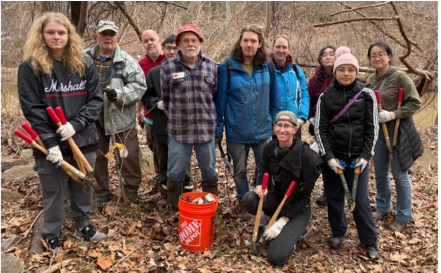
Our February wisteria volunteers