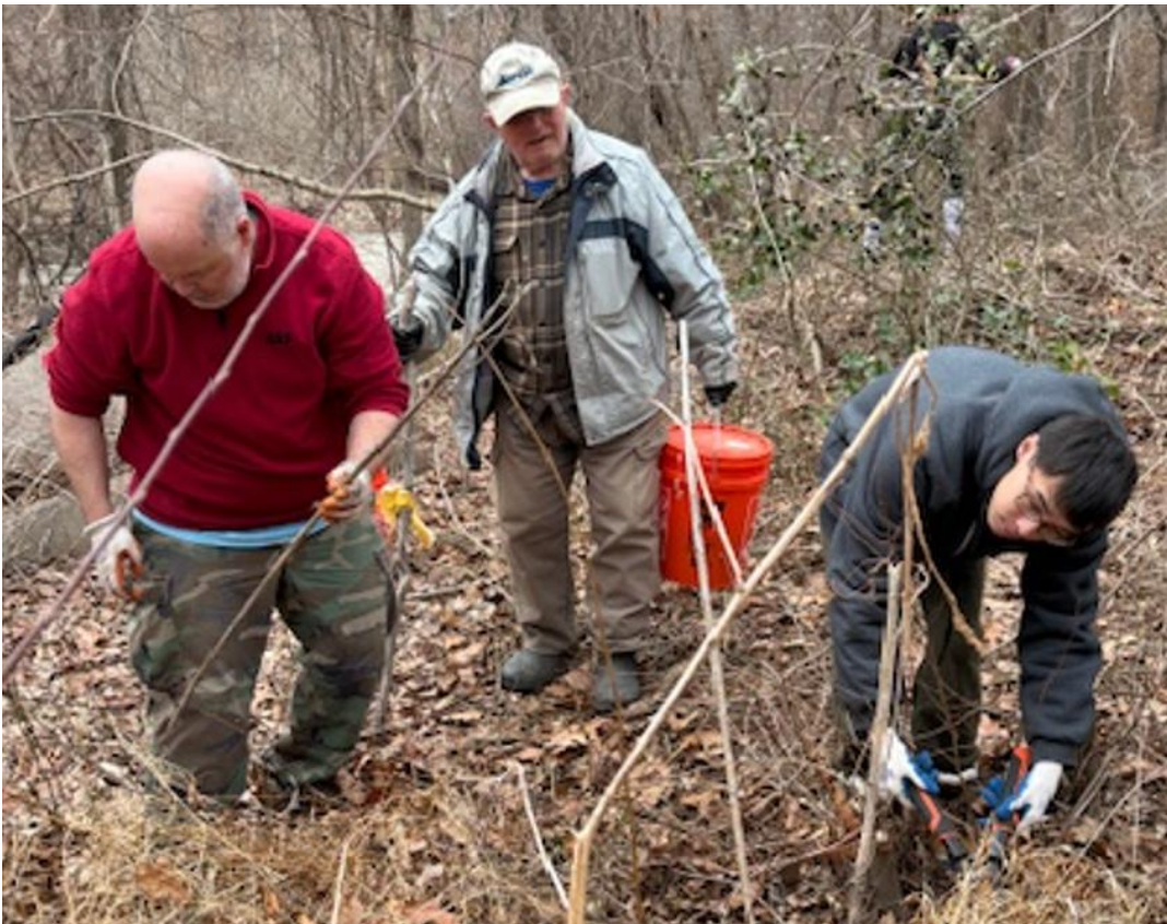
Down deep in the Gorge