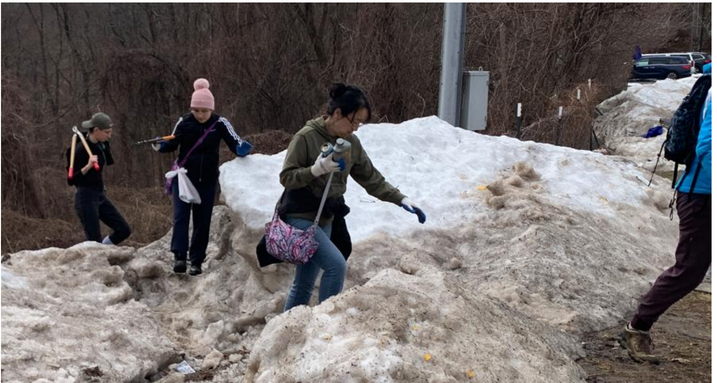
Trekking through the last mounds of snow