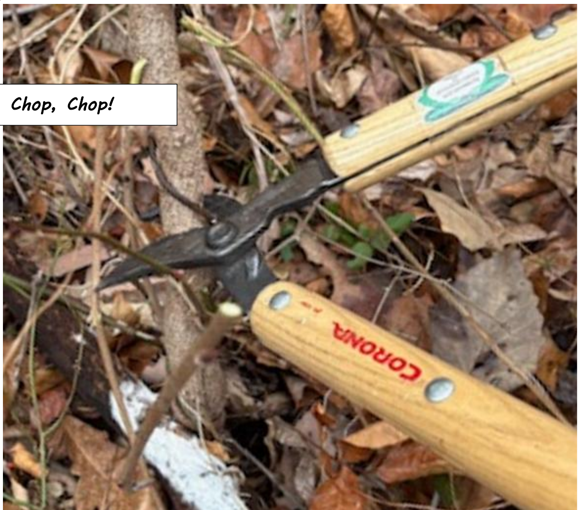
Chop, Chop, Chop!