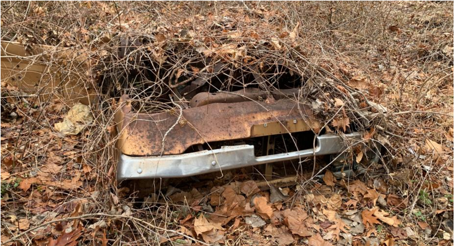
A future cleanup task