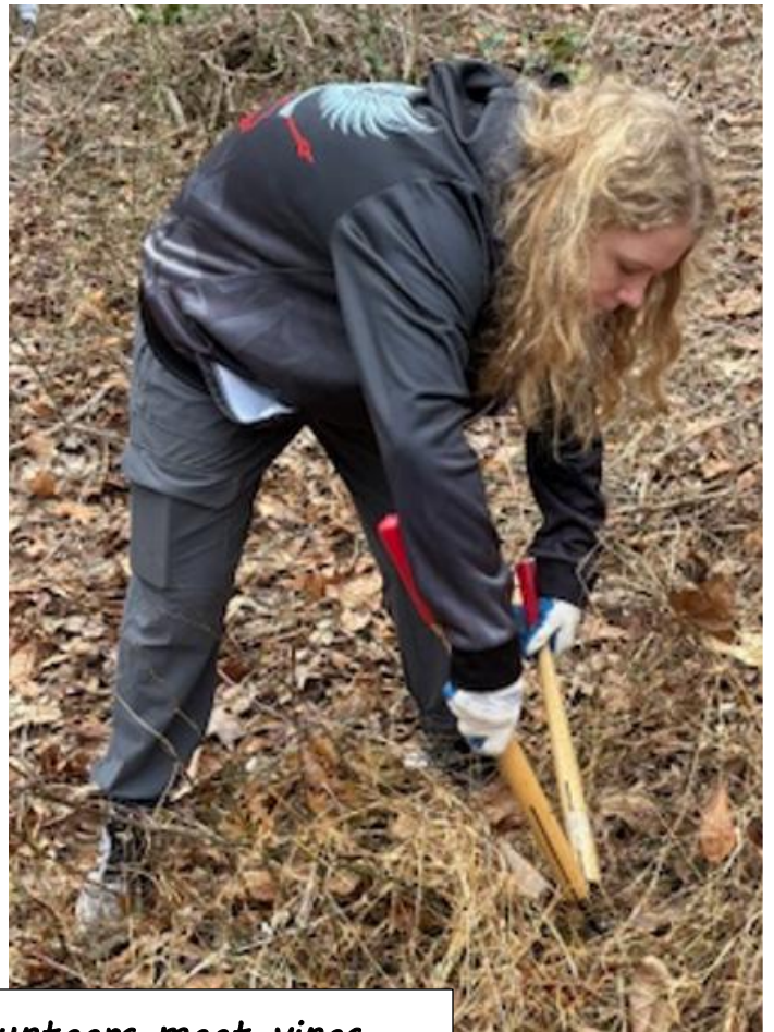
Volunteers meet vines