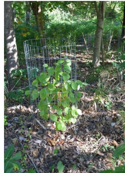
Trees and shrubs at the IMA site are caged to prevent deer browse.

Of note, IMA leaders who have undergone training have been recently permitted to apply herbicide, previously restricted. These efforts are now seeing a notable increase in the effectiveness of their efforts. Meanwhile FACC's tree rescuers continue to work in local neighborhoods.