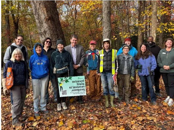
Launch of Fairfax PRISM, FACC donated $1,500 to get their Virginia Department of Forestry grant underway.

2025 has been another busy year for FACC, as we celebrate our 20 th anniversary of caring for the environment.