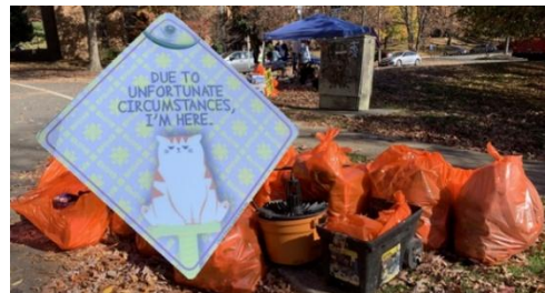
Trash collected during the International Coastal Cleanup

FACC works along 12 adopted stretches of Accotink Creek, and during the International Coastal Cleanup - 198 volunteers collected 230 bags of trash, 5 tires, and 4 shopping carts. Our collaborative volunteers included groups from Jack and Jill of America, Alliance of Youth Leaders in the United States, American President Line, Scales & Tails (a Washington-Liberty H.S. marine biology club), Girl Scout Troop 50103, Clark Construction, American Turkish Friendship Association, and Rotaract eClub District 7610.