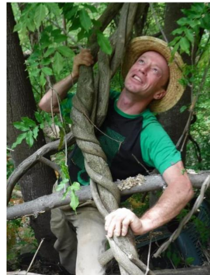
Fighting the invasive wisteria at Accotink Gorge. Observe the thickness of the invasive vines.