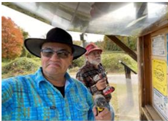
Repairing Signage along the trail