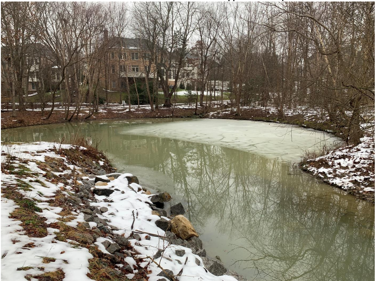
Upper Farrcroft pond