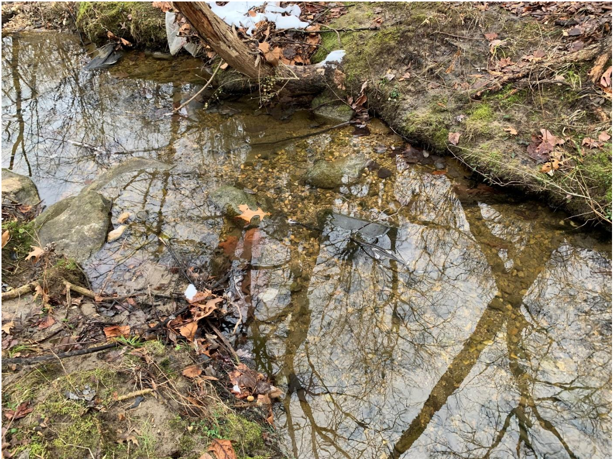
A small tributary running into the pond has clear water.