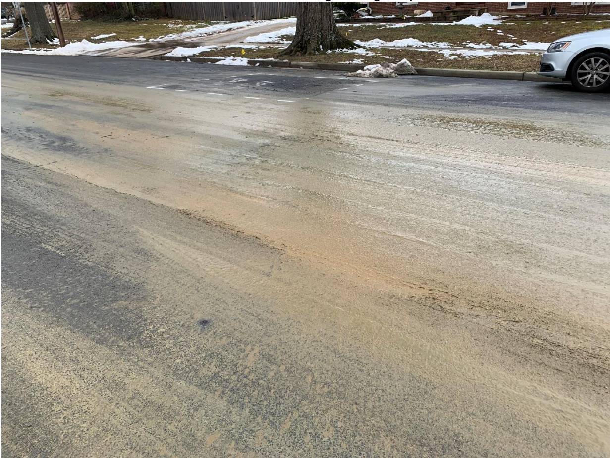
The condition of the street the next day. The rest of the sediment went down the storm drain into Daniels Run.