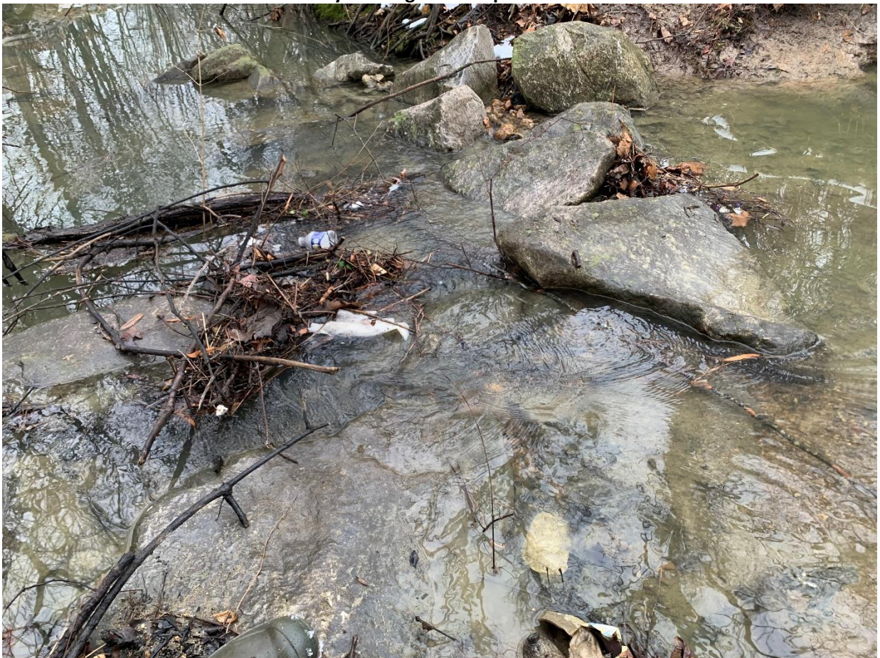
Daniels Run upstream from the upper Farrcroft pond is cloudy, but improving.