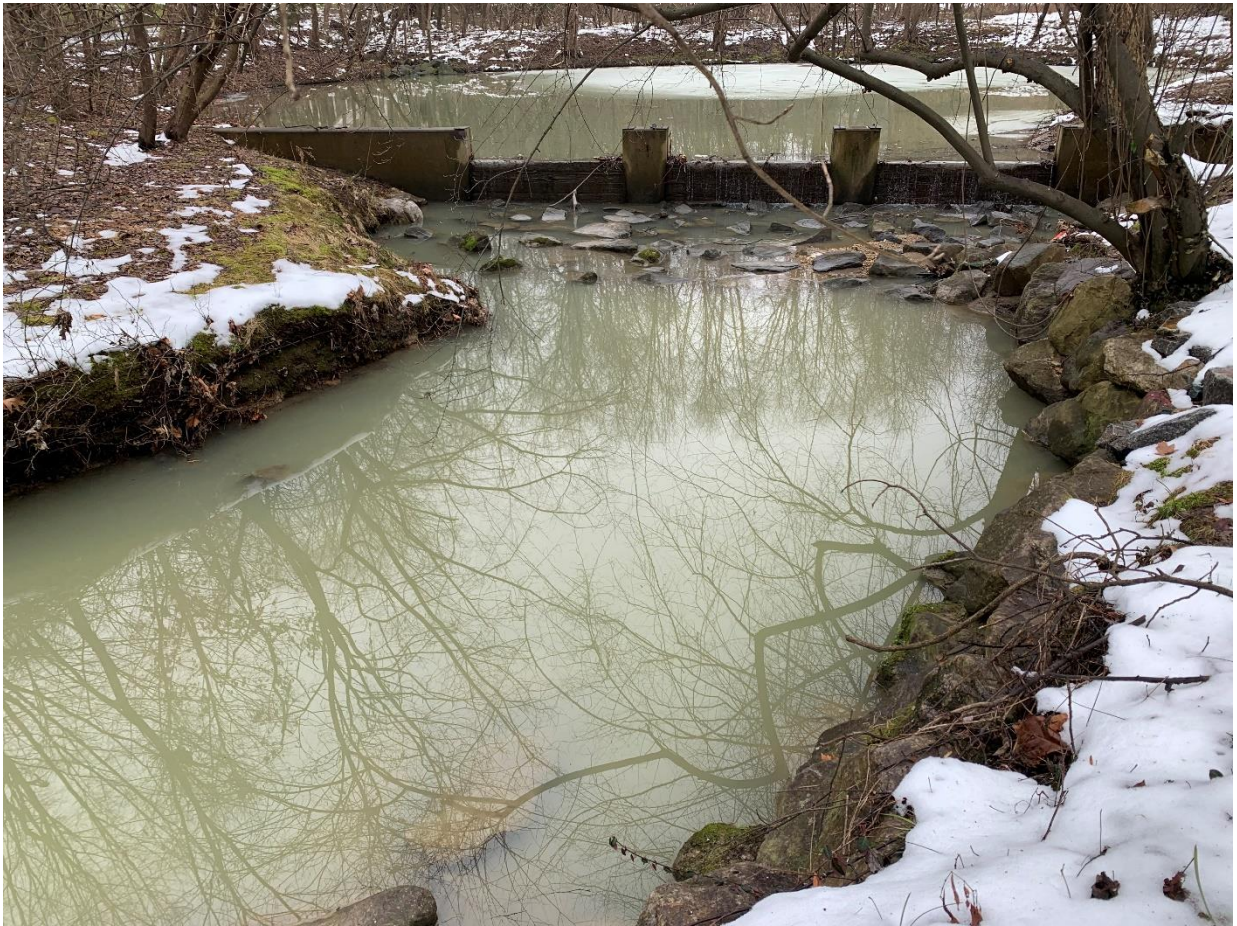
The worst section is downstream of the upper Farrcroft pond