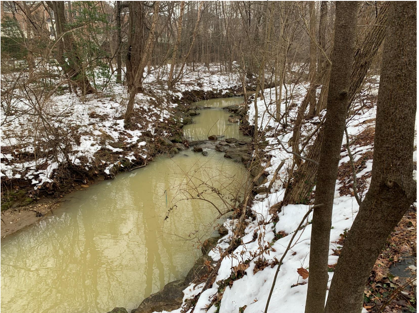
January 24, 2024 – Daniels Run is opaque with sediment

Water main breaks vary in severity, but they are much too common and none of them are good, dumping significant amounts of chlorinated water and sediment into Accotink Creek. Here is documentation of one such break, along the Daniels Run tributary in Fairfax City.