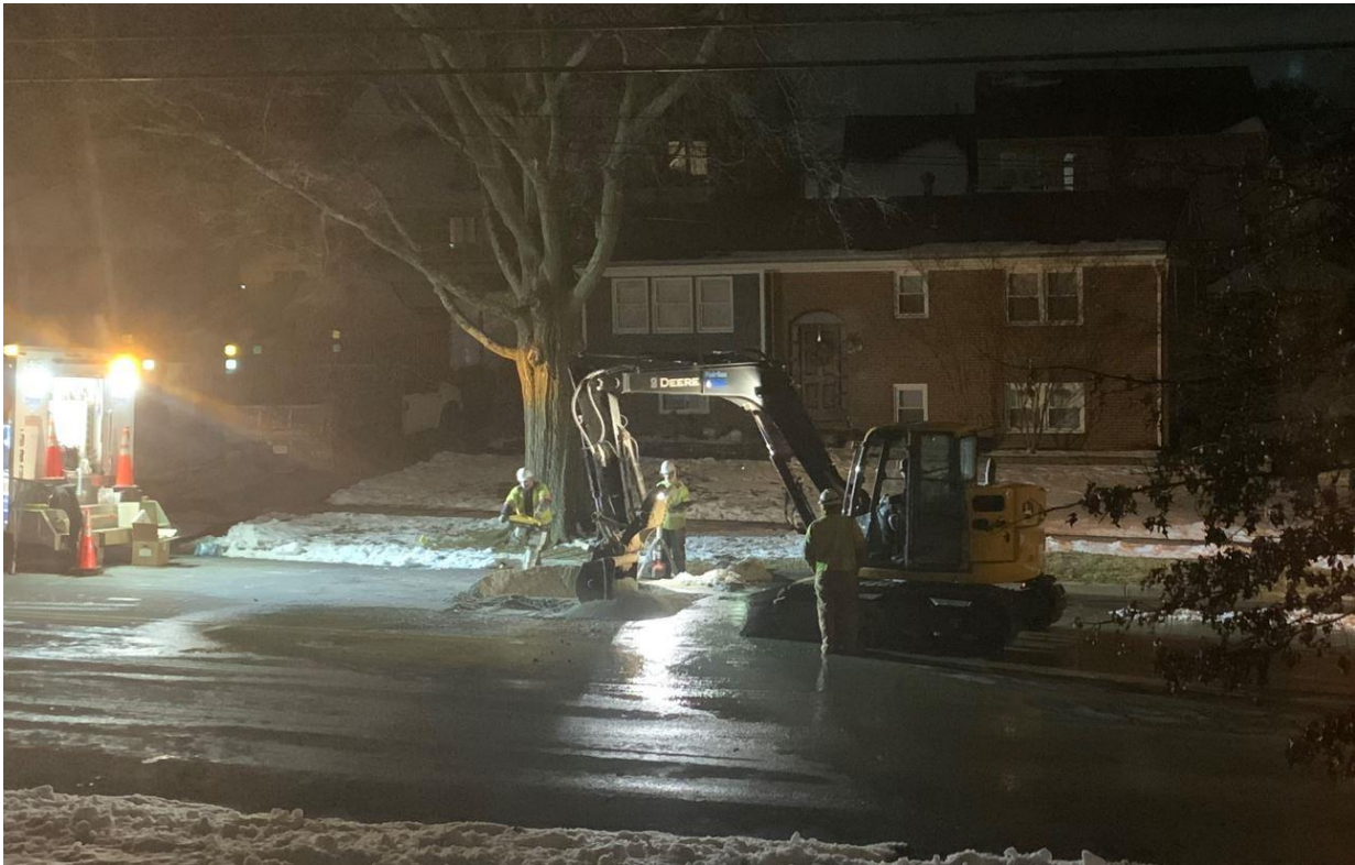
The apparent cause of the sediment in Daniels Run was a water main break at 4220 University Drive, near City Hall Fairfax Water crew making overnight repairs.