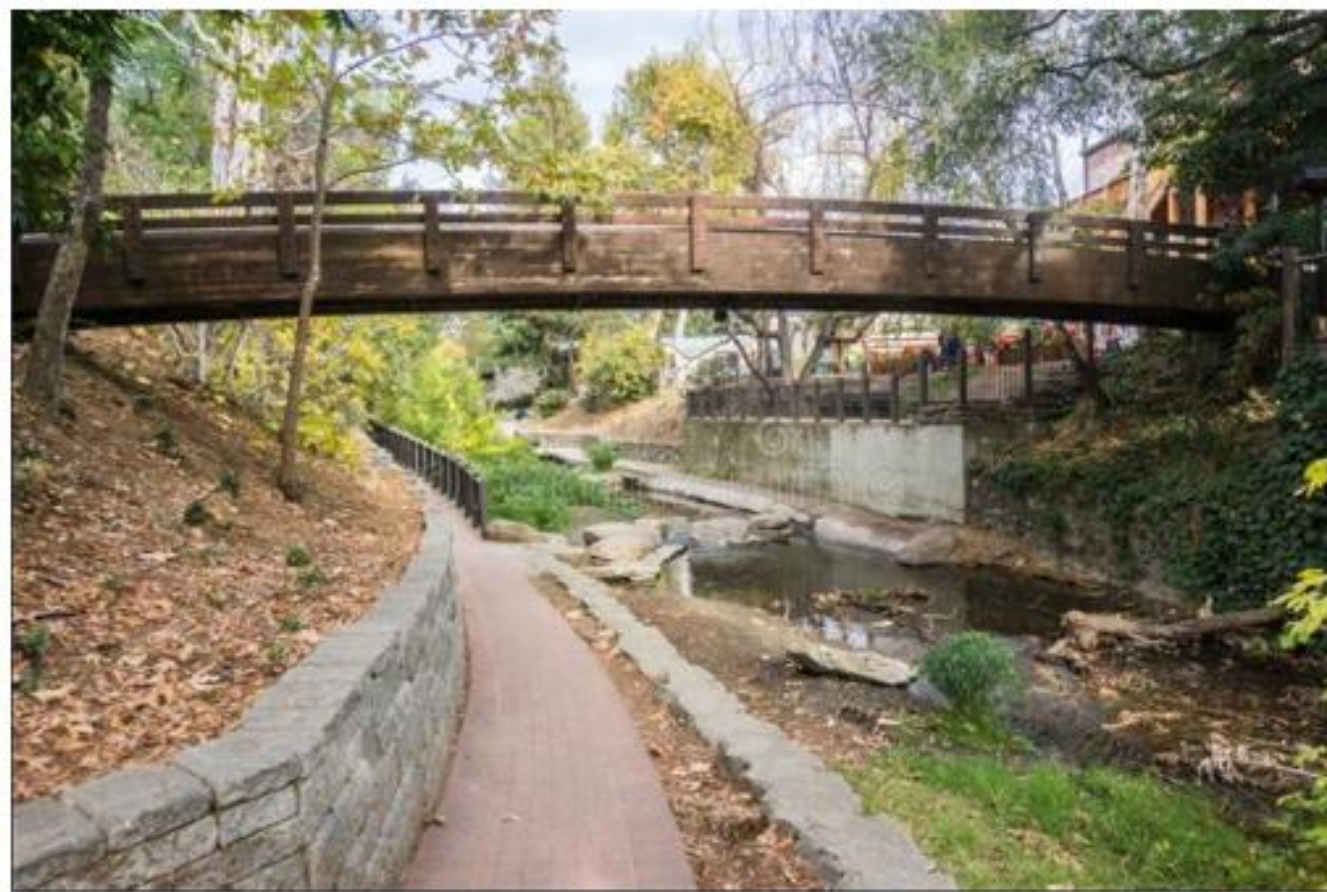
Creek Walk, San Luis Obispo, California

Two examples of small streams incorporated as amenities into urban settings while retaining much of their natural character