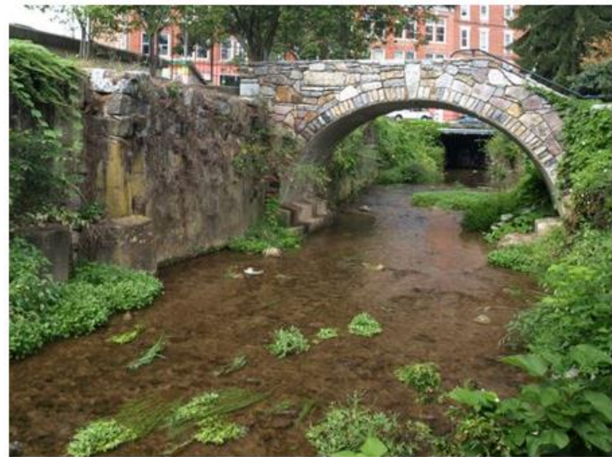
Lewis Creek, Staunton, Virginia