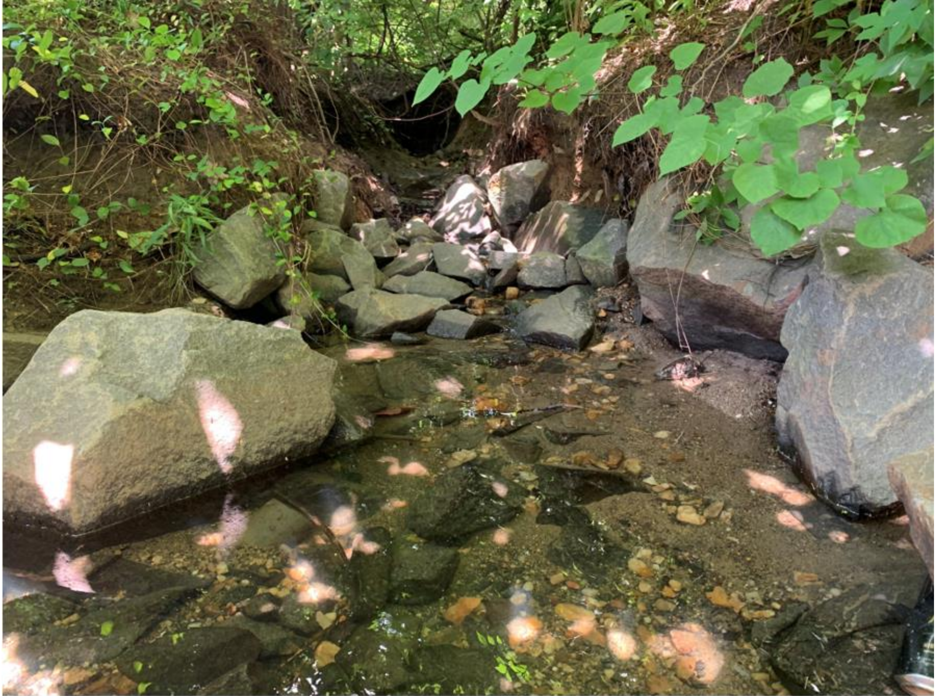
Small and incised and unprotected, but it is still a living stream. It deserves to be cherished as an amenity and not buried as a nuisance.